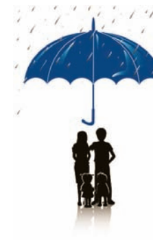
Life & Health Insurance