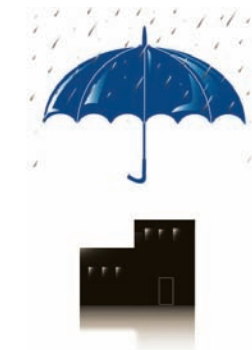
Business & Employee Insurance